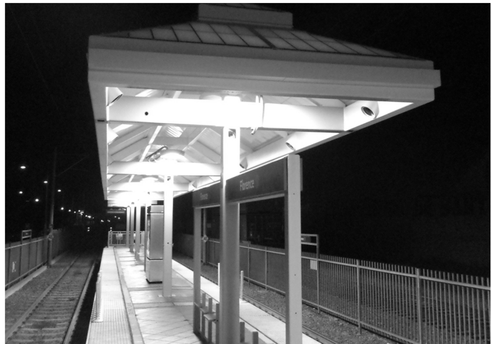
New Florence Station canopy with new lighting