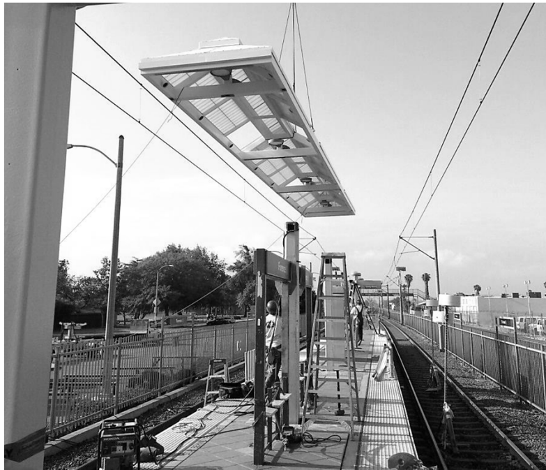
Installing new canopy at Florence Station