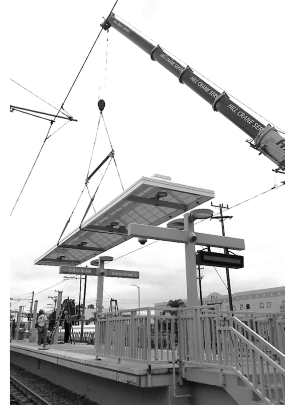
Washington/San, Pedro/Grand, and Canopies; all three set on June 6, 2015