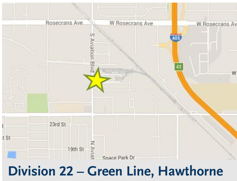
Division 22 – Green Line, Hawthorne