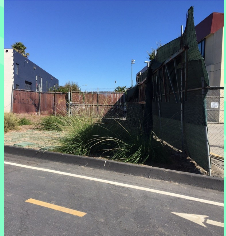
Looking south from Expo bike path towards gate at 18th Street. CSM has plans to open this gate for pedestrian traffic only. Opening this gate to the public is causing Crossroads to make additional improvements along the east end of their lease area.