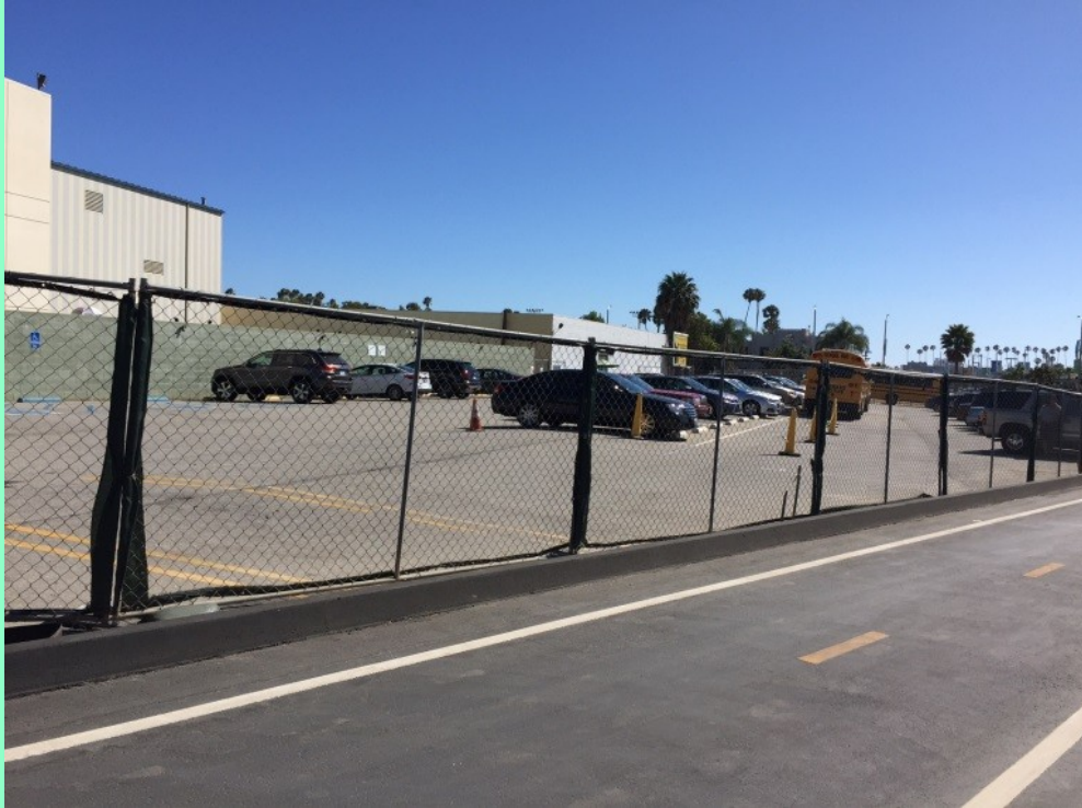
Looking southwest from Expo bike path towards Metro R/W currently leased to Crossroads School for parking.