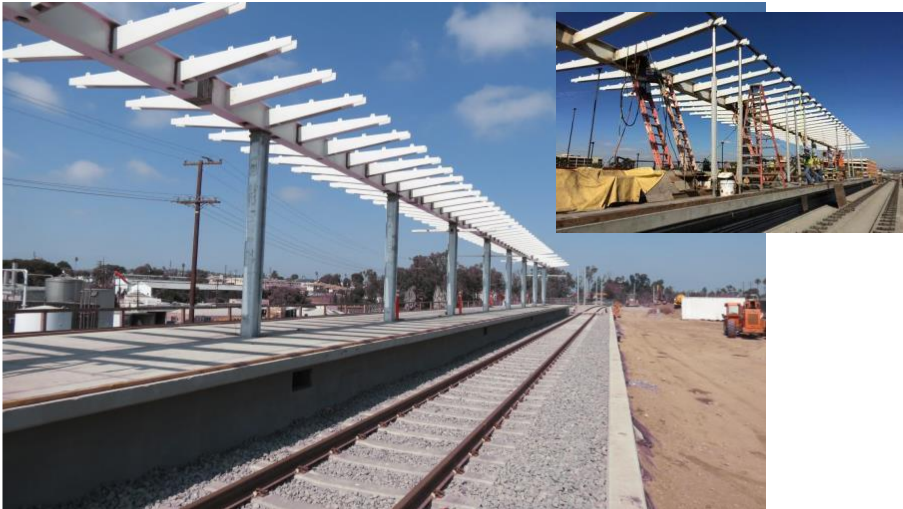
Downtown Inglewood Station