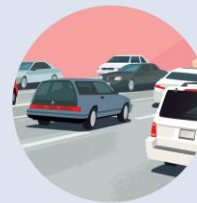
Highway Improvements $1.5 billion/year