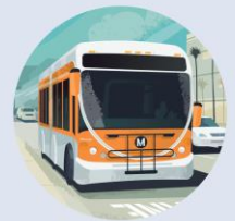
Public Transit Investments $750 million/year