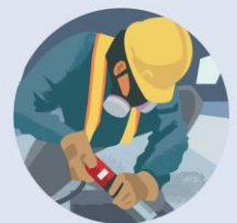
Local Partnership Program $200 million/year