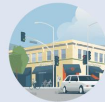
Local Street and Road Improvements $1.5 billion/year