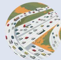
Congested Corridor Solutions $200 million/year