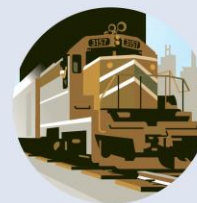
Freight Capacity Expansion $300 million/year