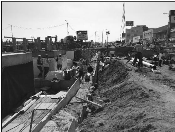
Gas Line Embedded Forms Left in Place (Expo Closure)