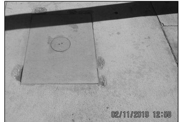
Spalling at Meter Box (West side, 50 th & 52 nd )