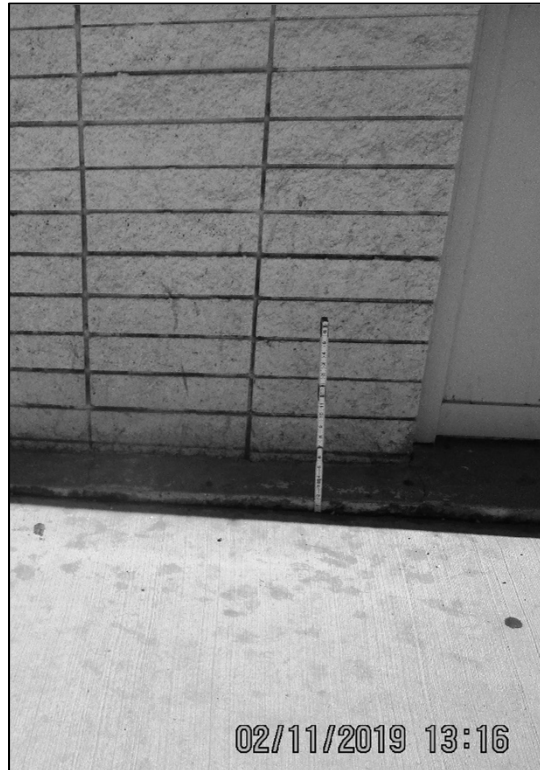
Back-of-walk lippage w/private property (Crenshaw NB 57 th St )