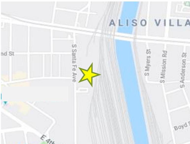
One Santa Fe – LA