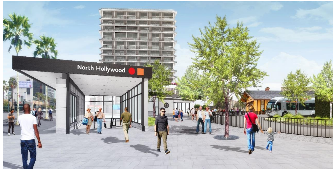
View of G Line Terminus Looking South