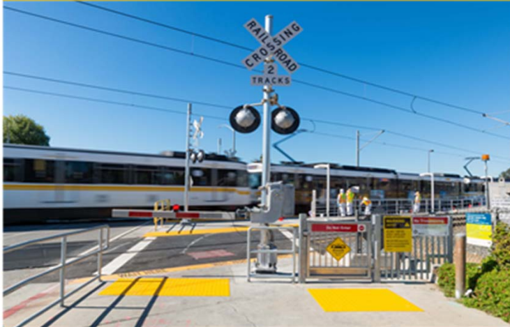
REGIONAL AT CORRIDORS