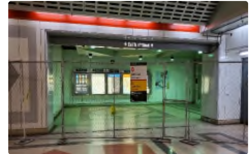
7th St/Metro Ctr (Hope St NW/Qdoba Entrance)