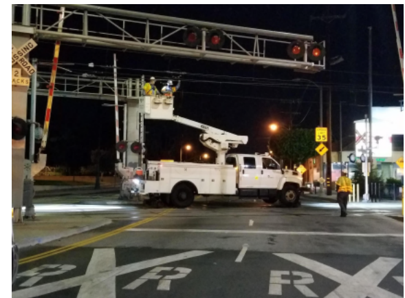
Traction Power Staff On-Site