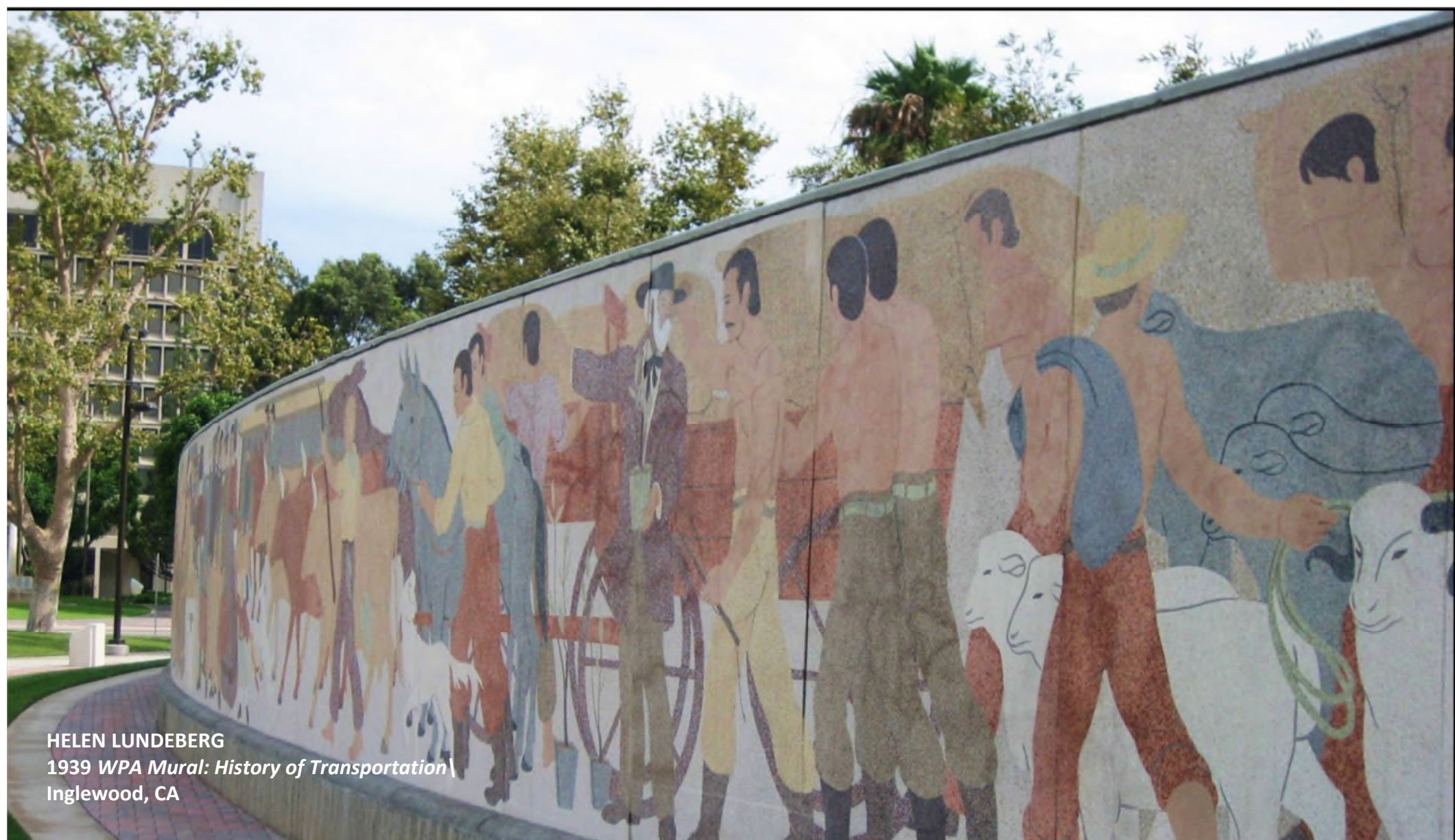
HELEN LUNDEBERG 1939 WPA Mural: History of Transportation Inglewood, CA

“Think about how artists might be included in the Reimagining of transportation”