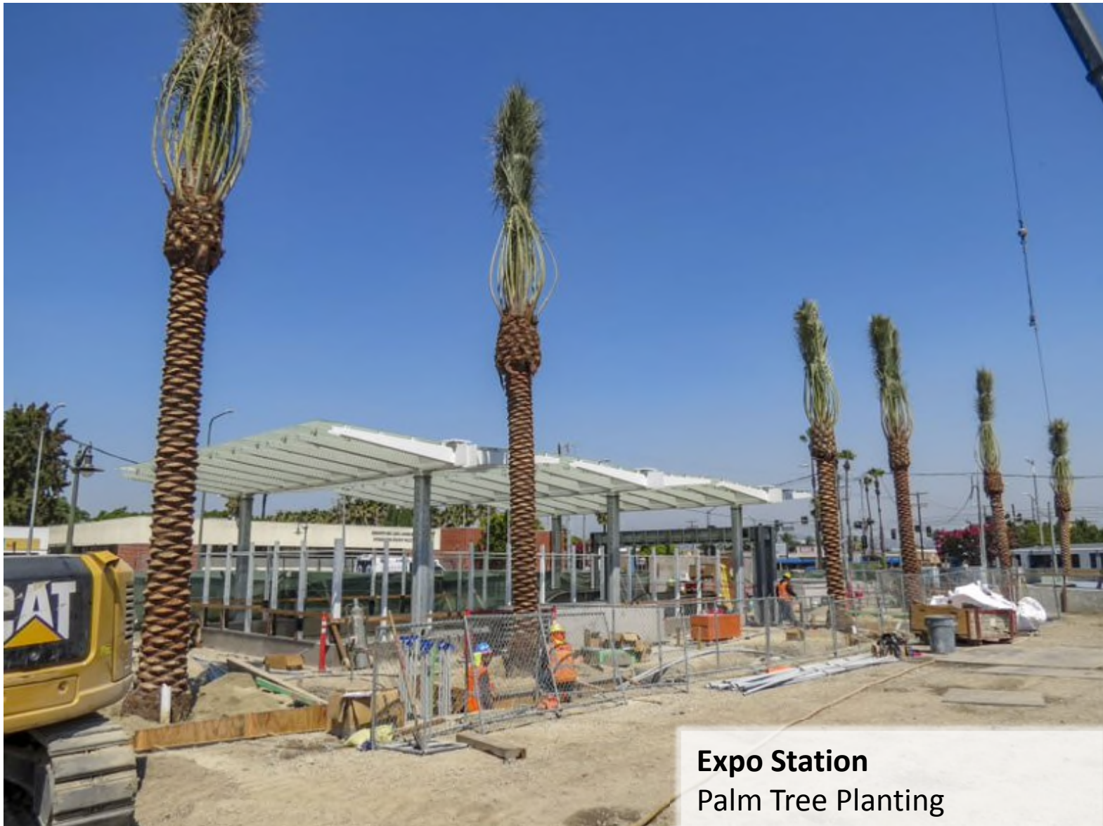
Expo Station Palm Tree Planting