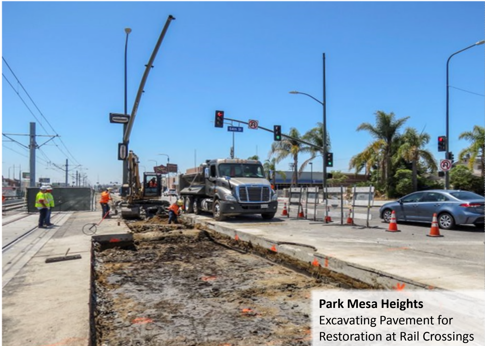
Park Mesa Heights Excavating Pavement for Restoration at Rail Crossings