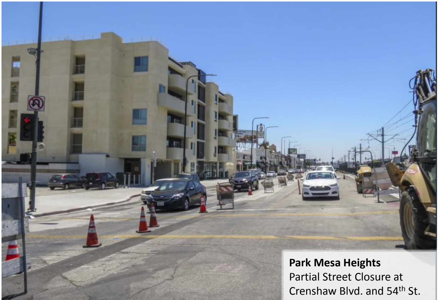
Park Mesa Heights Partial Street Closure at Crenshaw Blvd. and 54 th St.