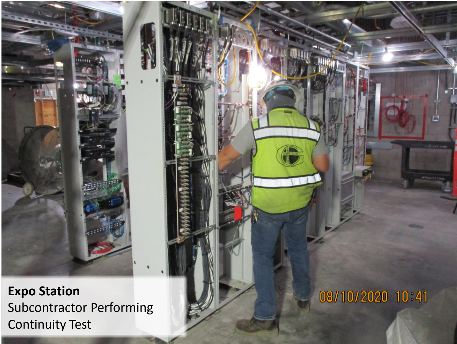
Expo Station Subcontractor Performing Continuity Test