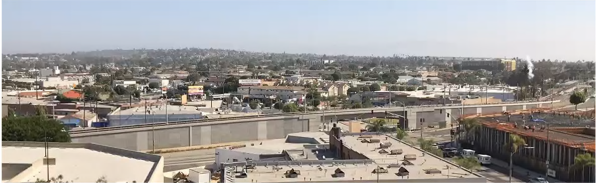
Train Testing at La Brea Bridge (Downtown Inglewood)