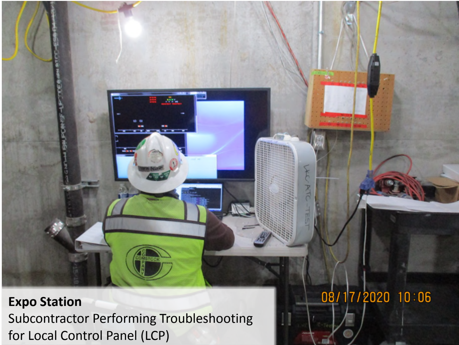
Expo Station Subcontractor Performing Troubleshooting for Local Control Panel (LCP)