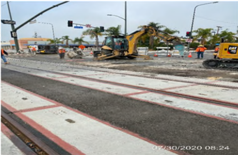
Excavating/removing section of pavement for restoration on southbound Crenshaw Blvd and 54th St.