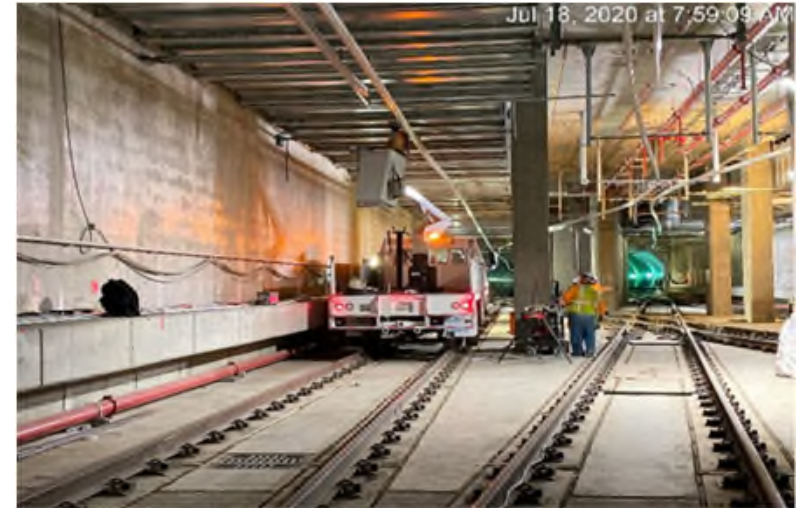
Continue installing supports and fixtures for the crossover lighting at the invert level of Expo/Crenshaw Station.