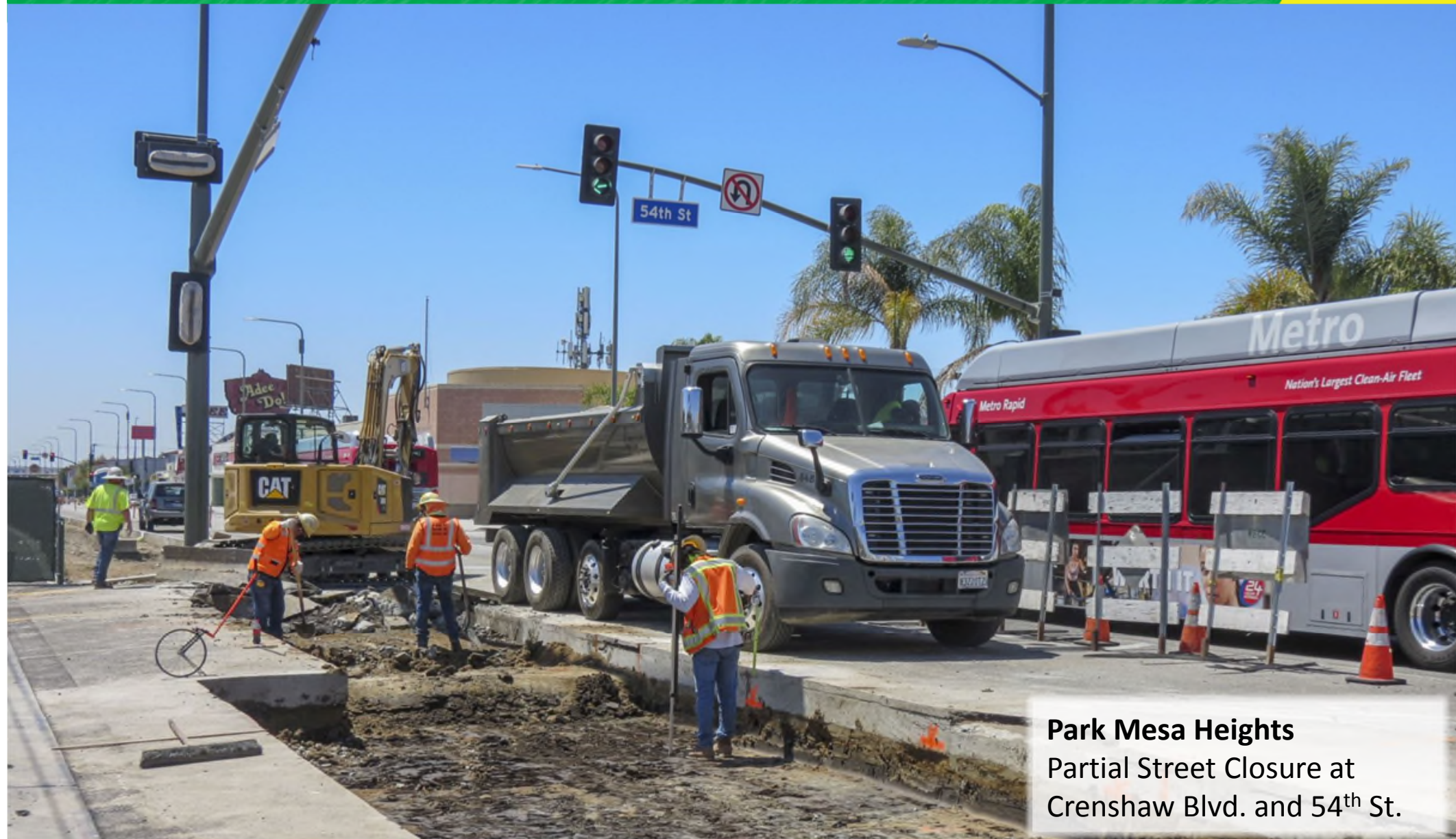
Park Mesa Heights Partial Street Closure at Crenshaw Blvd. and 54 th St.