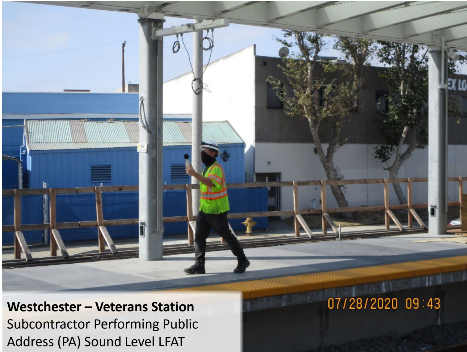
Westchester – Veterans Station Subcontractor Performing Public Address (PA) Sound Level LFAT