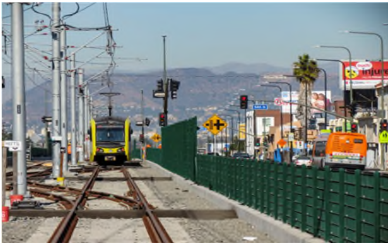
P3010 LRT Vehicle testing on Crenshaw Blvd. and 54 th Street.