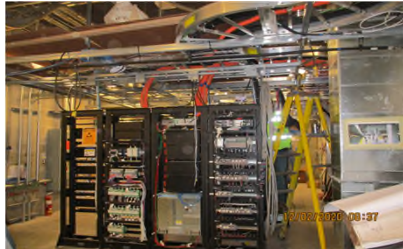
Leimert Park Station – contractor working on communication rack in train control and communication room.