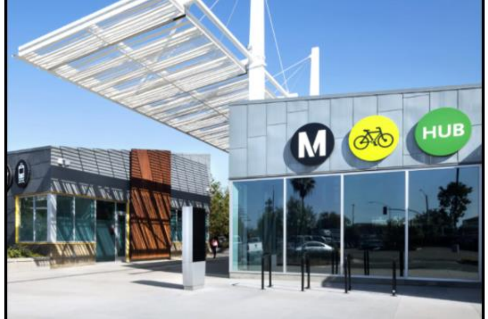
Above: eLock Technologies Lockers, as seen at UCLA – Metro Bike Lockers Retrofit with Digital Upgrades and Daily Parking Option