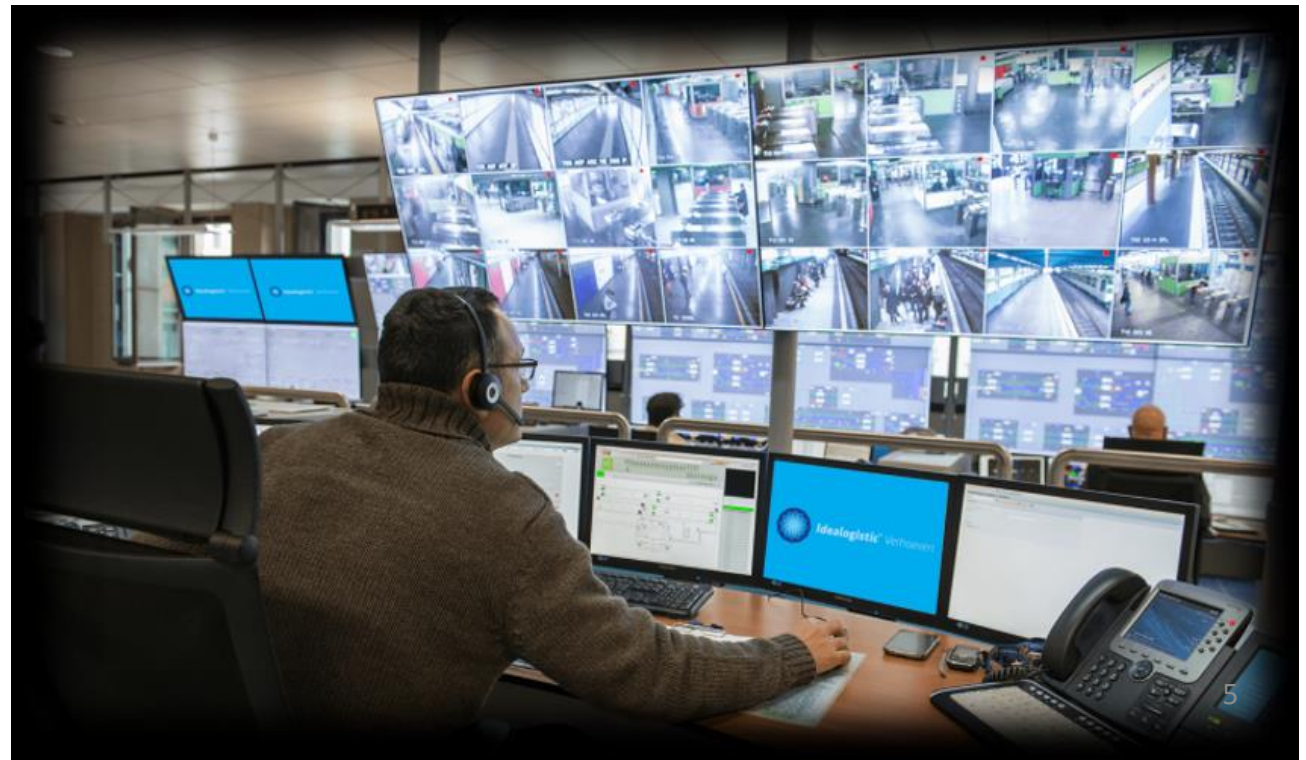
Lower right: Remote Monitoring Control & Customer Service Center