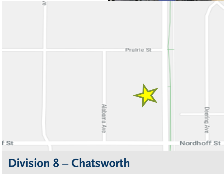
Division 8 – Chatsworth