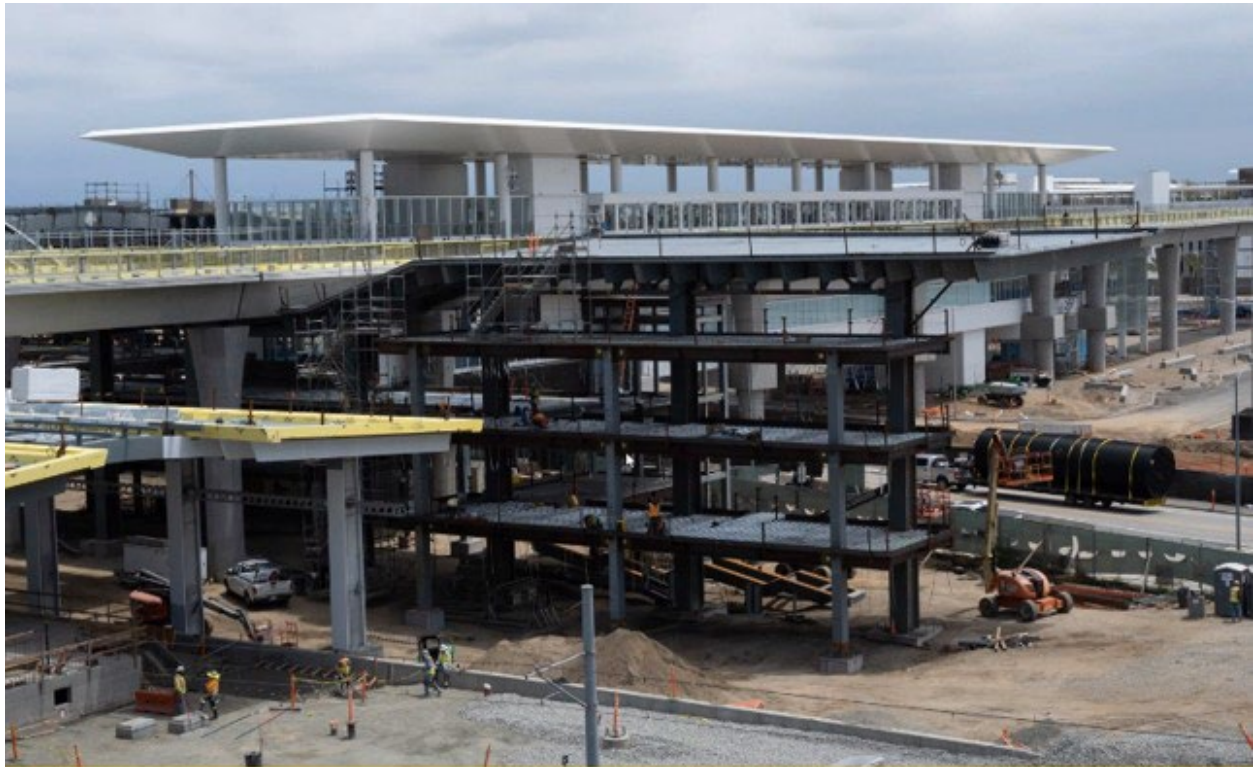
Airport Metro Connector and Los Angeles Airport Automated People Mover construction site