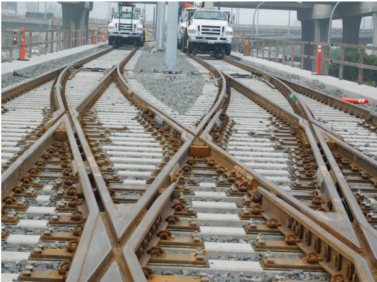
Crenshaw project - Elevated double crossover rail above Aviation Blvd. and below 105 freeway

During the review, we identified areas where policies, procedures, or practices could be improved and made recommendations to adopted for capital project delivery best practices to be accomplished. The recommendations are at the end of each Category area in Chapter 3 and are also summarized in Chapter 5. Additionally, a Table of 2023 Recommendations / Responses for Metro Senior Management to respond is at Appendix 6.