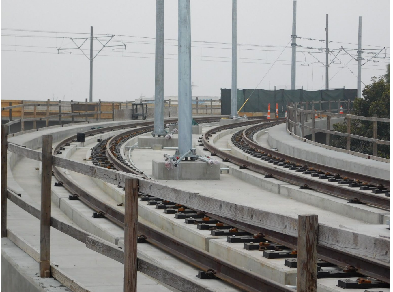
Crenshaw project – K Line – elevated tracks

implemented without consideration of older, inter-dependent transit facilities and in-house facilities capital improvement projects.