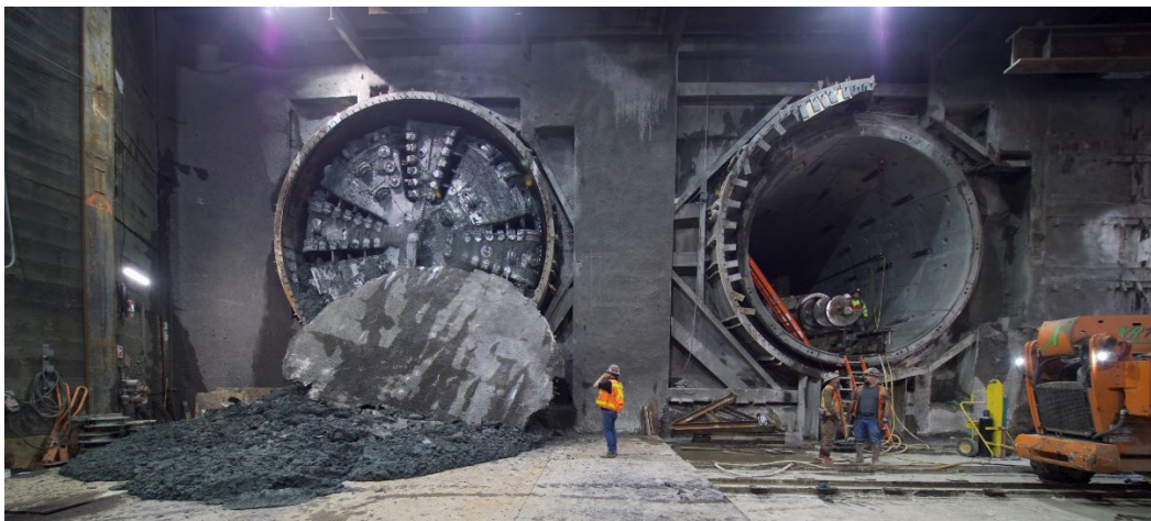
Tunnel Boring Machine break through at Purple Line Extension Section 1