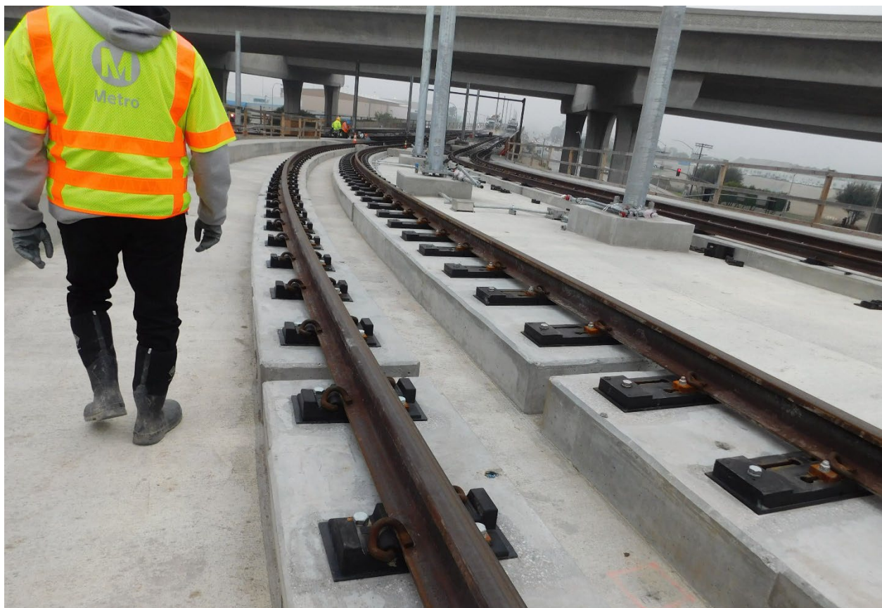
Crenshaw project – K Line - Elevated concrete fixed rail above Imperial Highway and below 105 Freeway