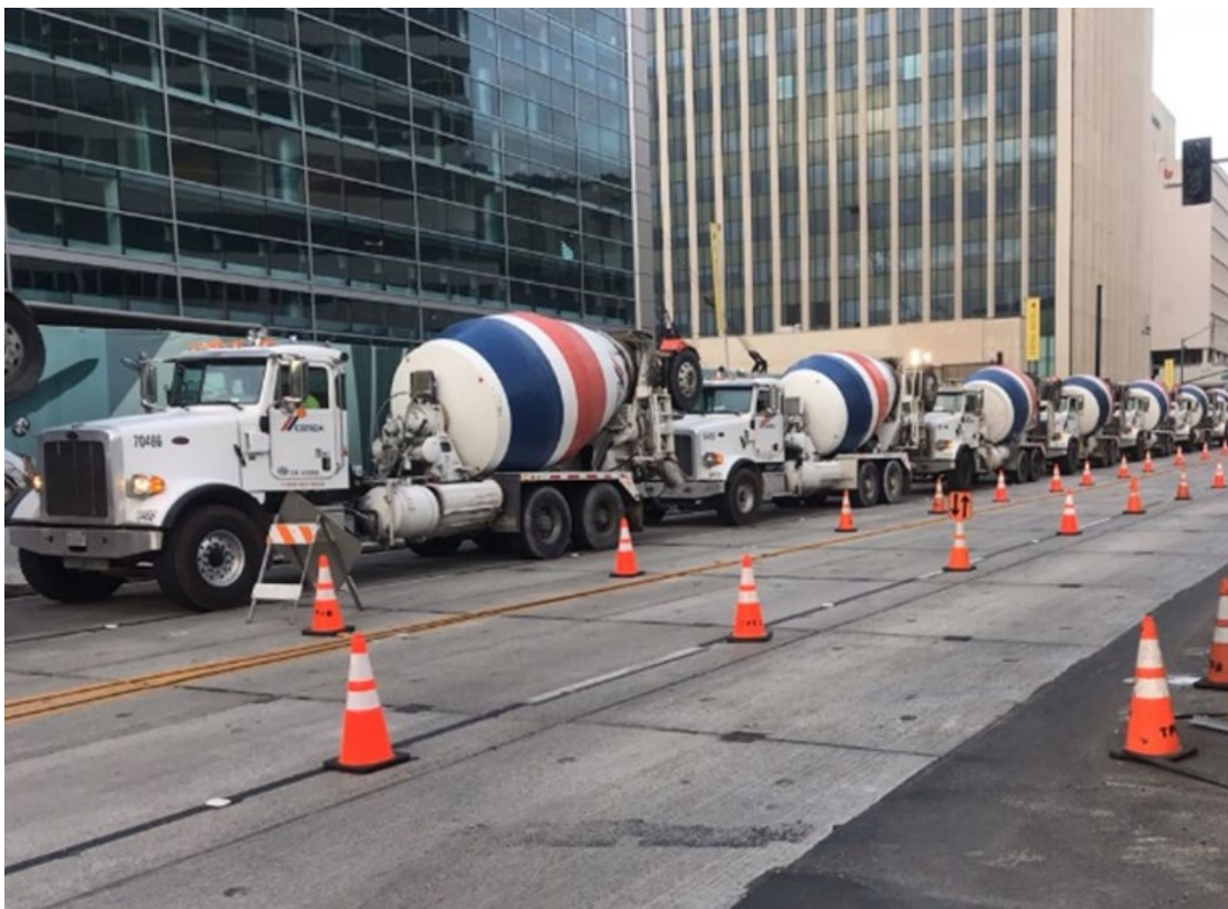
Concrete trucks on Wilshire Blvd awaiting delivery to Rodeo station for concrete slab