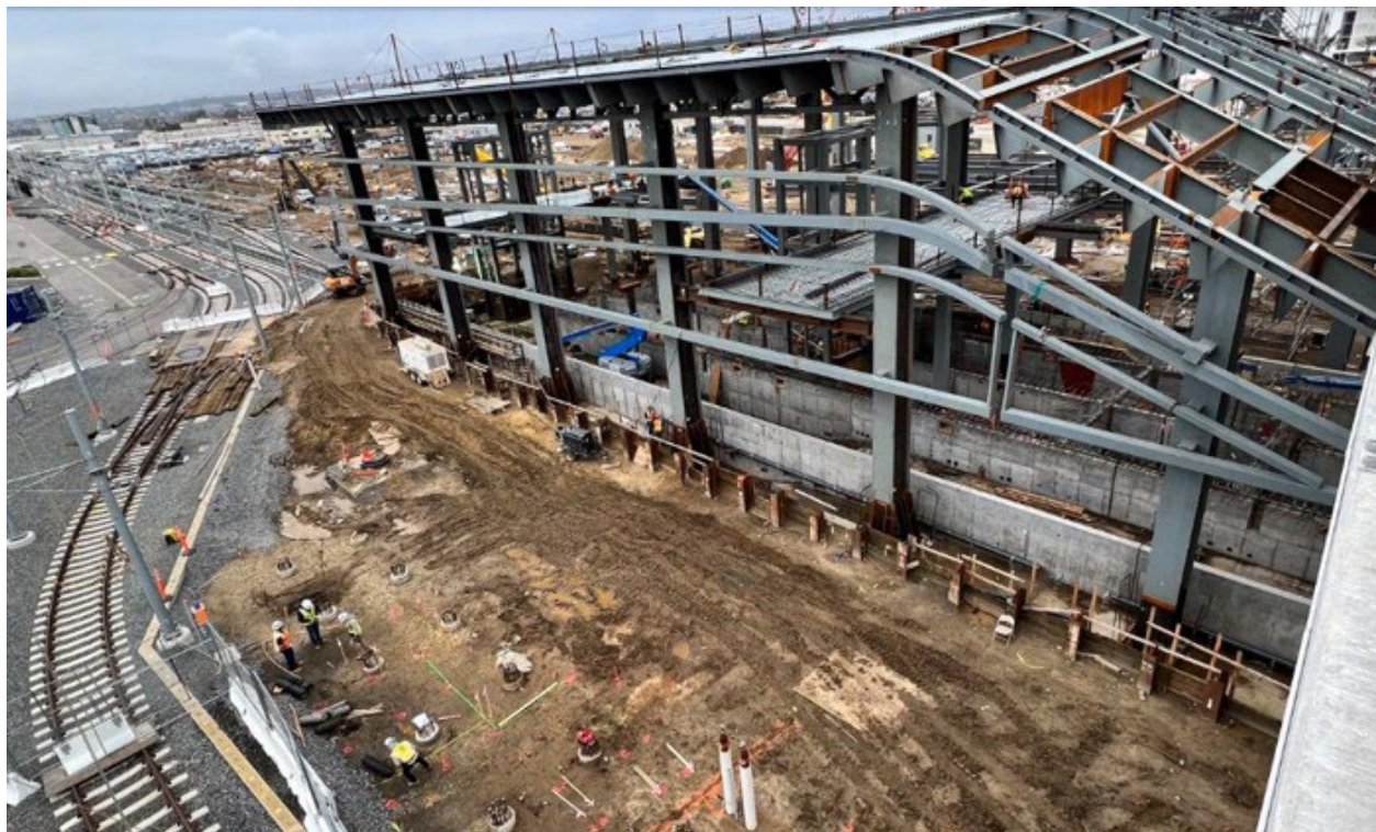
Airport Metro Connector project adjacent to Division 16 rail yard and maintenance facility