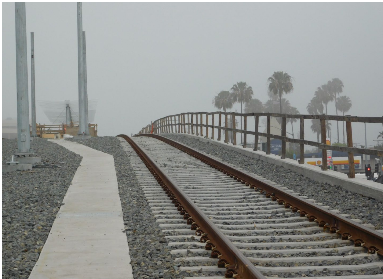
Crenshaw project – K Line - Elevated rail above Aviation Blvd. and W. Century Blvd.