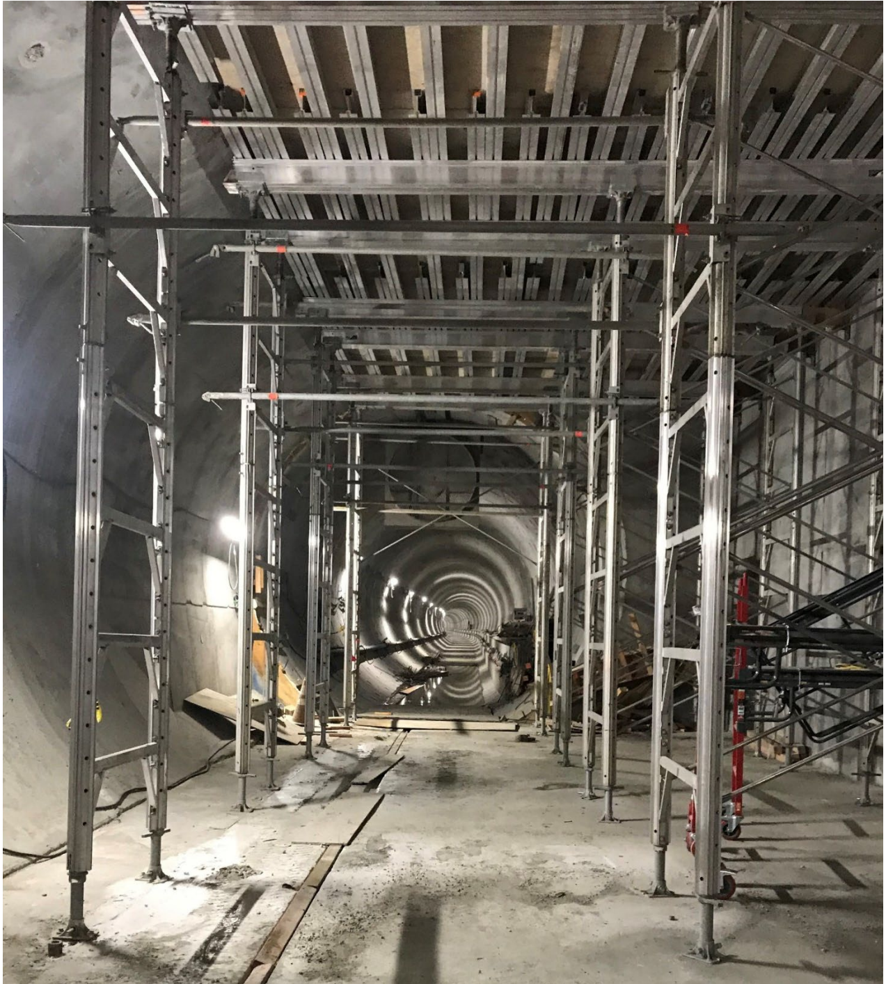
Purple Line Extension Section 1 tunnel and scaffolding framework