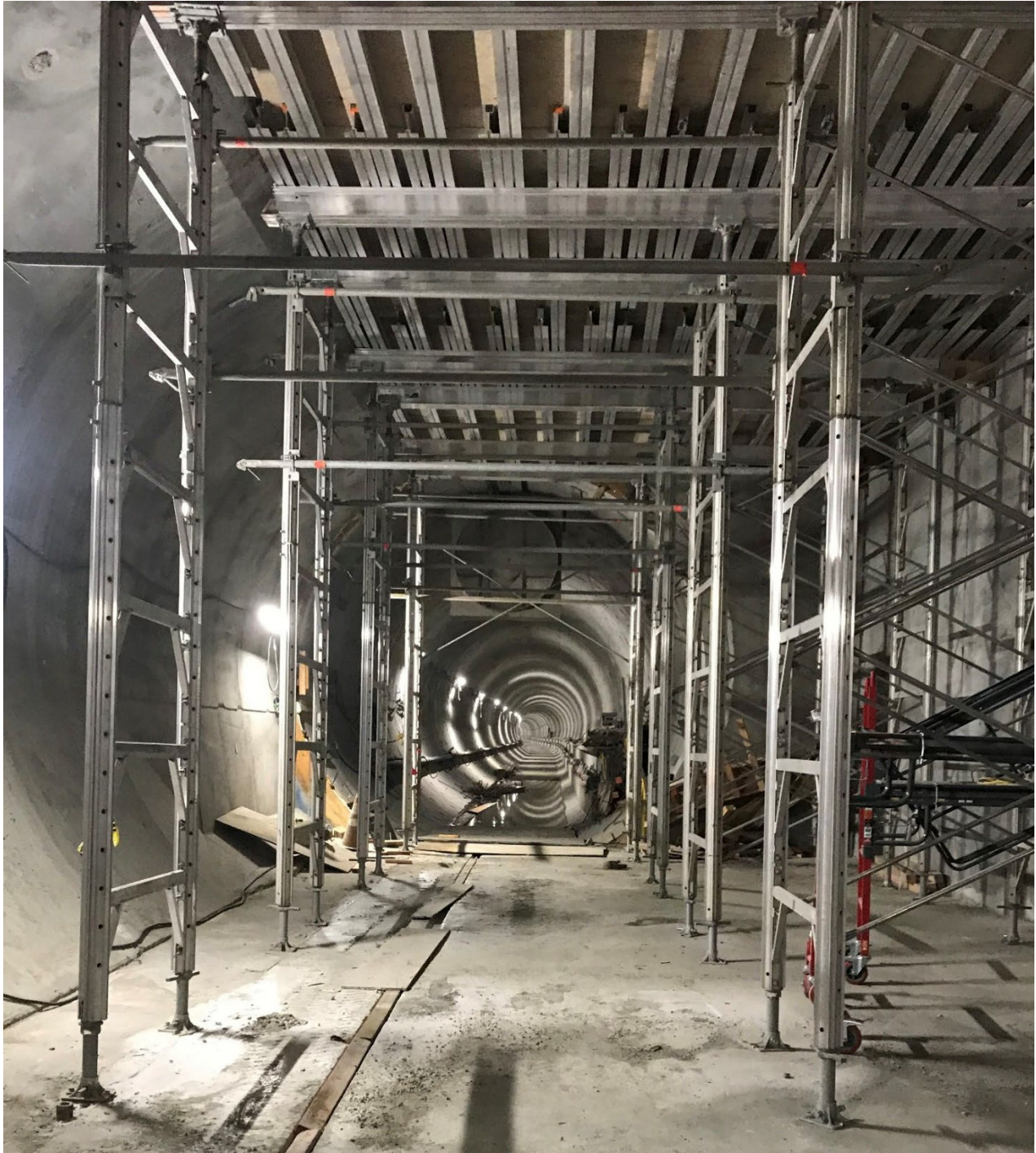
Purple Line Extension Section 1 tunnel and scaffolding framework