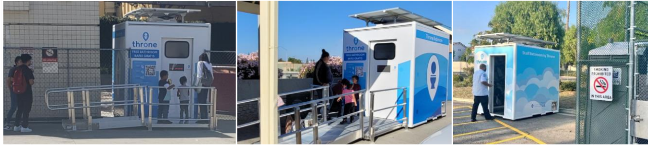
Pilot locations at Westlake/MacArthur Park, Willowbrook/Rosa Parks, Norwalk and Sylmar Bus Layover

anthonydrakeandassociates 6d This is great!