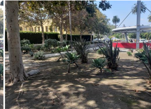
Before & After: Addressing hiding spots previously used for illicit activity is improving outdoor plaza cleanliness and safety