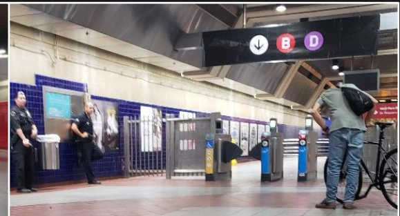
Multilayered human approach of Custodians, Ambassadors, Homeless Outreach, Security and Law Enforcement