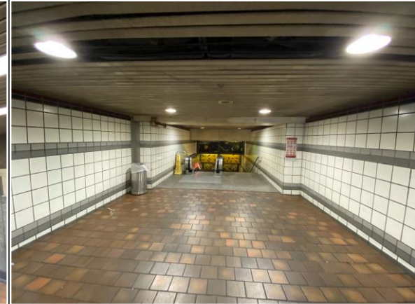
In July 2023, crews installed nearly 100 brighter, LED bulbs at station entrances and passageways to restore comfort and safety