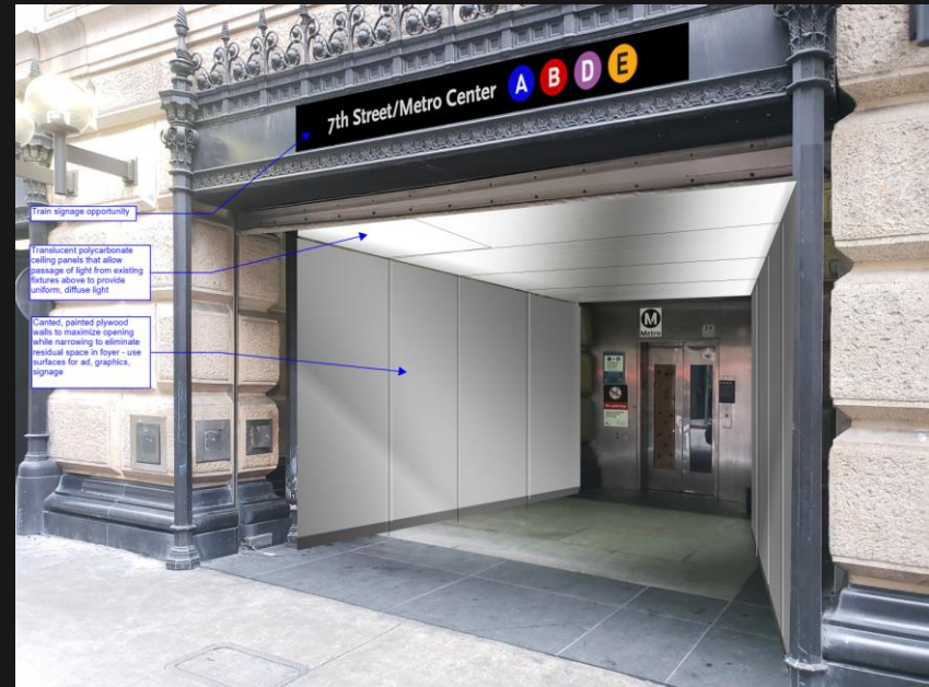
Existing & Concept: Tactical lighting, rightsizing, and signage improvements to create a safe, intuitive, welcoming entrance