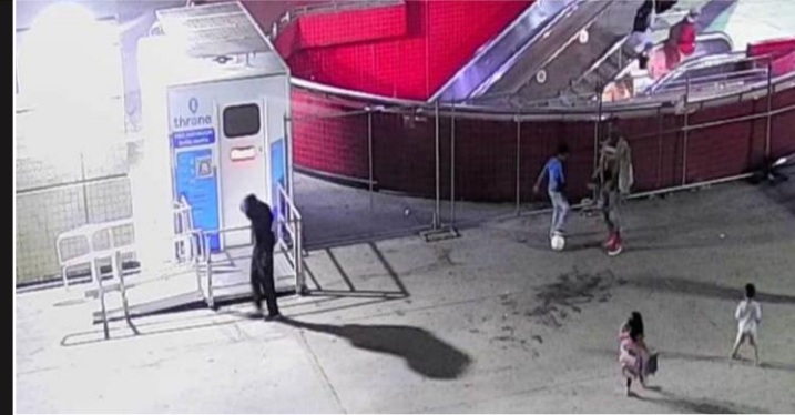
Clean, safe, well-lit station & seating // Over 20% reduction in emergency exit misuse since mesh install // Children playing soccer under brighter lights & CCTV