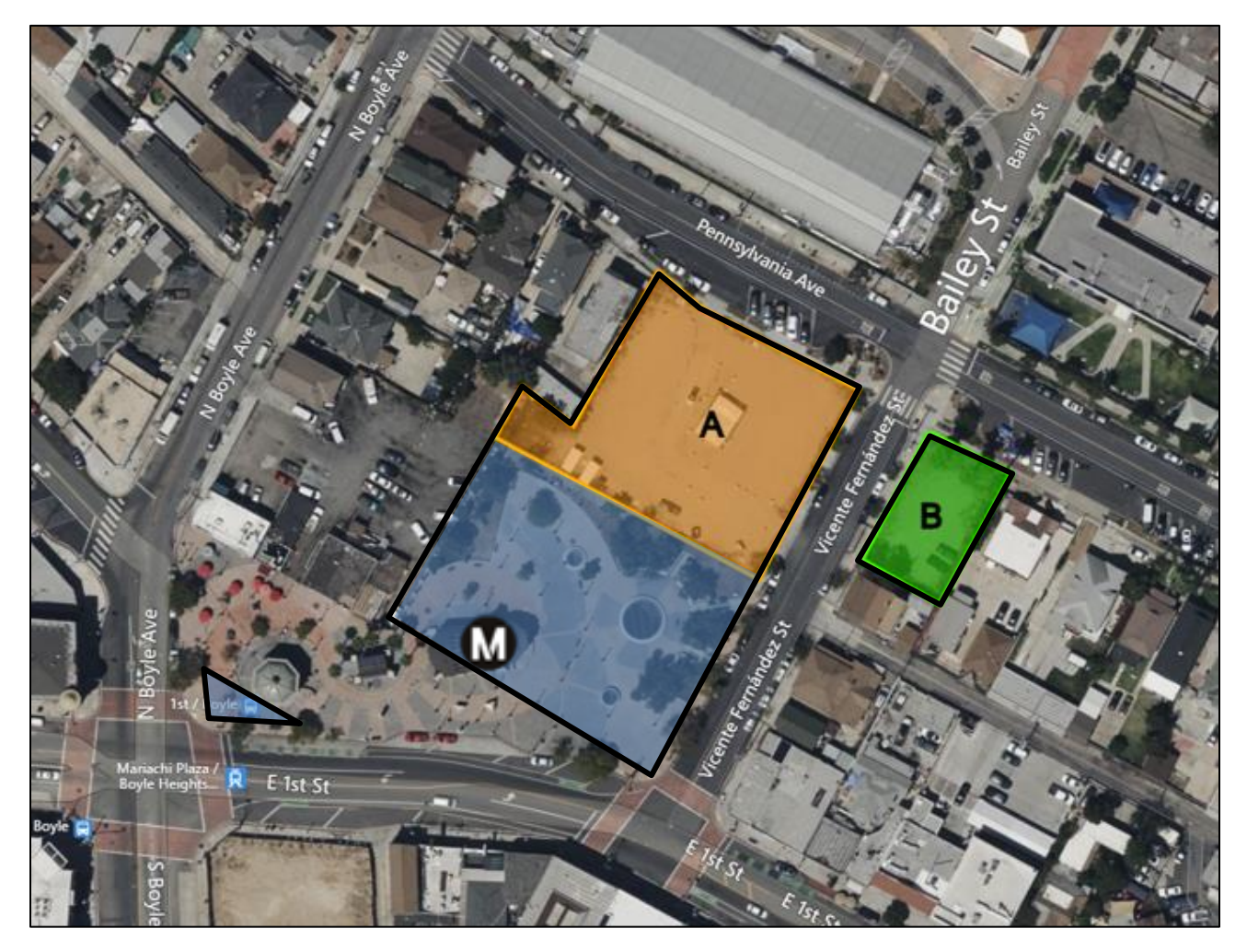
Exhibit A LACMTA Property