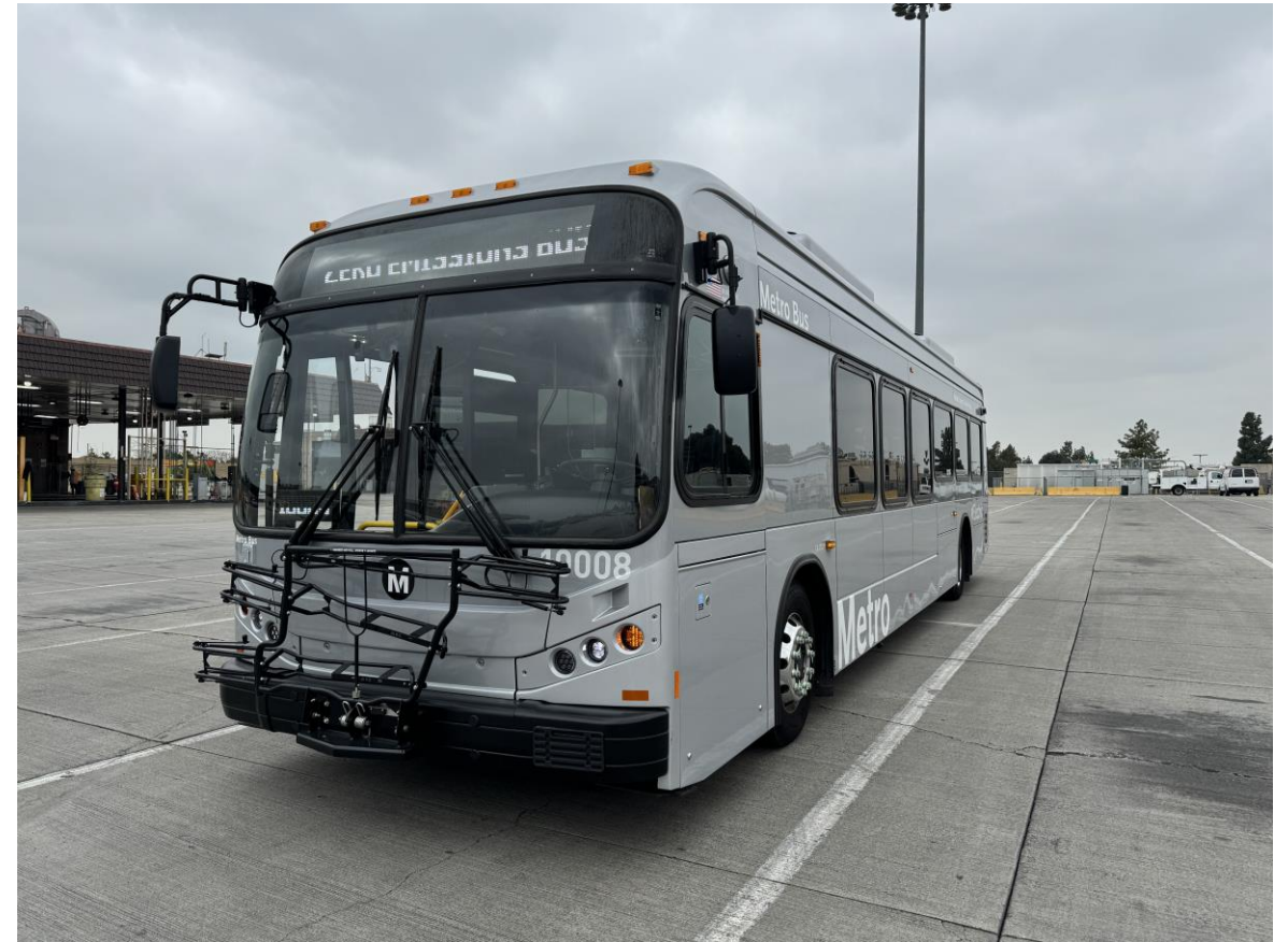
Photo: BYD K9MD bus