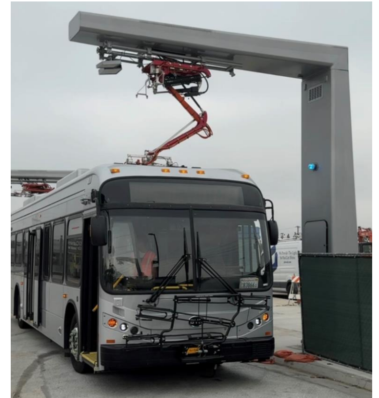
Photo: First charging session at HGTC