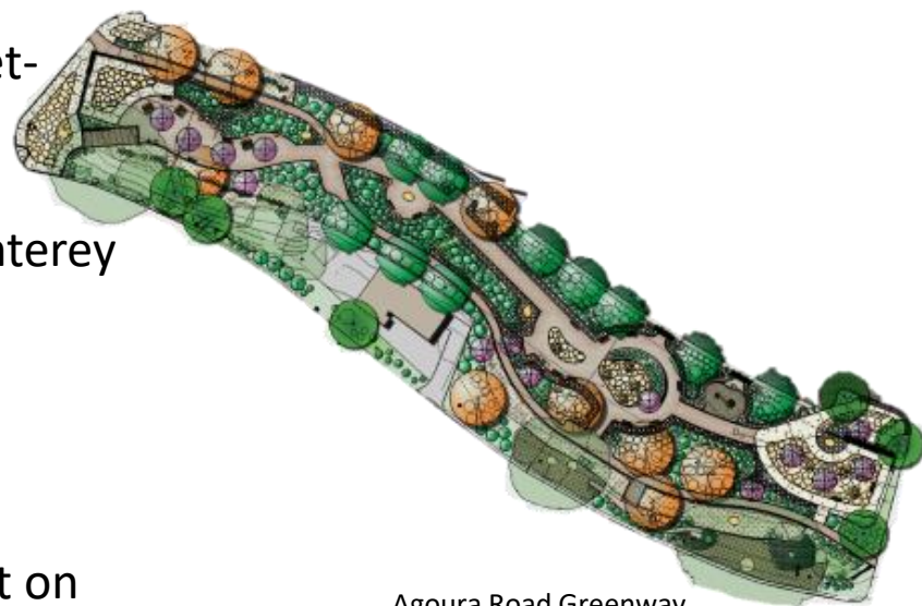
Agoura Road Greenway