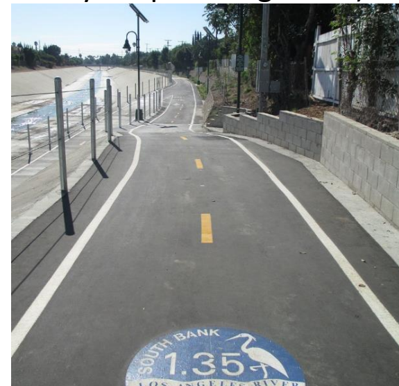
Segment of LA River Bike Path completed in 2014