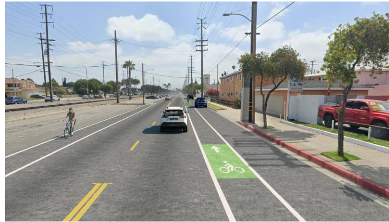
State St to LA River