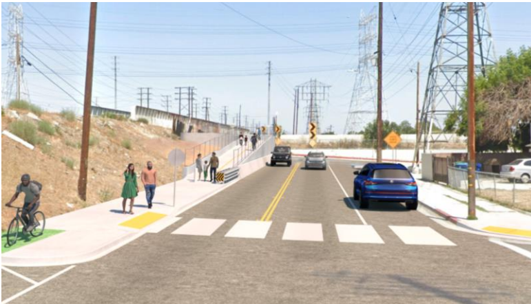
LA River Bike Path Connection