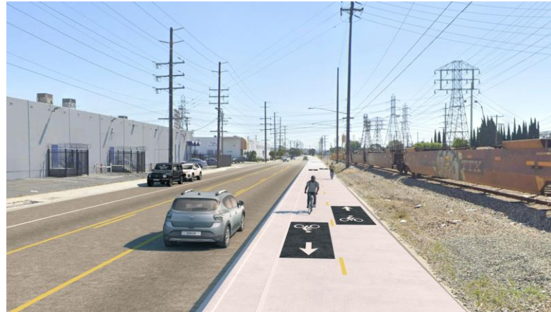
Eastern Ave to Garfield Ave