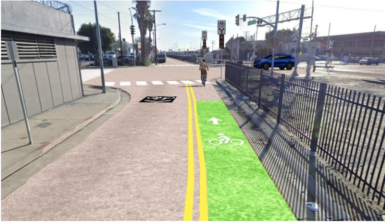
Slauson Ave to Holmes Ave