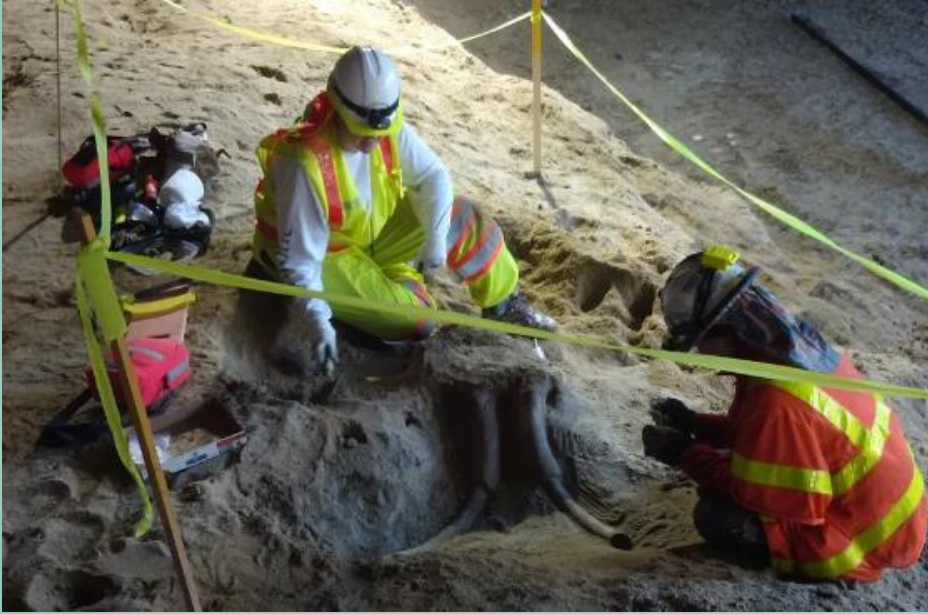
Purple Line Extensions Section 1- Paleontological resource recordation and recovery.