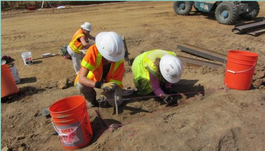
Union Station-Archeological Monitoring and resource evaluation