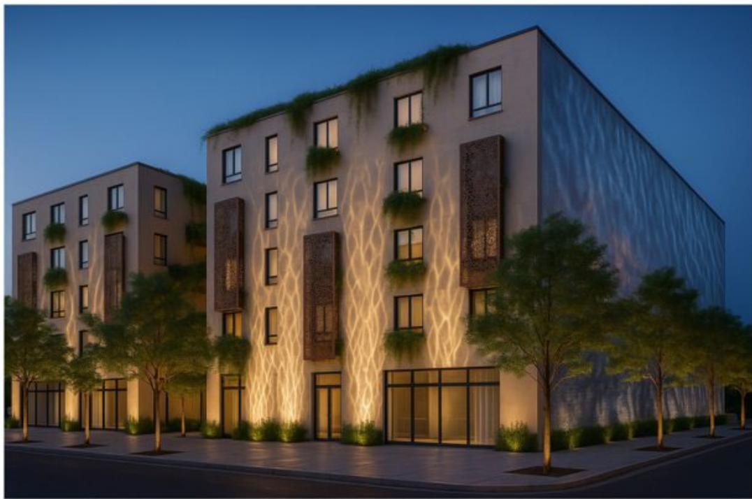
THE NATHANIEL 4421-4437 CRENSHAW BOULEVARD LOS ANGELES, CA 90043