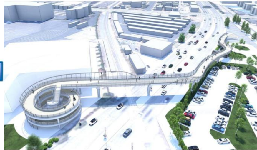
An aerial rendering of the La Verne Regional Multimodal Bridge. Note the large, clear cube in various renderings represents future transit oriented development.